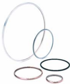
Metal sealing products

Parker's highly-engineered metal seal designs offer customized solutions for more demanding applications, where extreme temperature, corrosive media, high vacuum, near-zero leakage or long life concerns are present. As materials used in a resilient metal seal preclude effects of gaseous permeation, these seals provide exceptional performance in critical vacuum applications. Resilient metal seals are made-to-order for specific applications, and offered in many configurations, including: