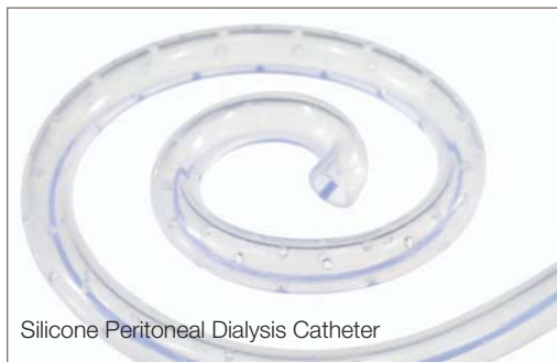
Silicone Peritoneal Dialysis Catheter