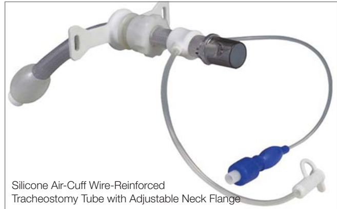
Silicone Air-Cuff Wire-Reinforced Tracheostomy Tube with Adjustable Neck Flange